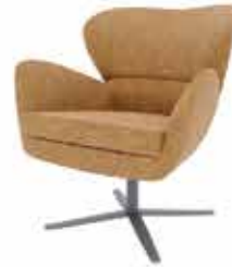
Metal cross D13