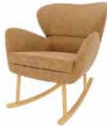
Wooden legs H16