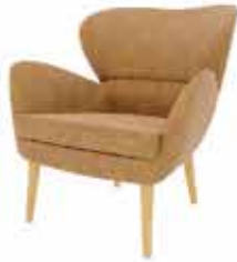
Wooden legs GL